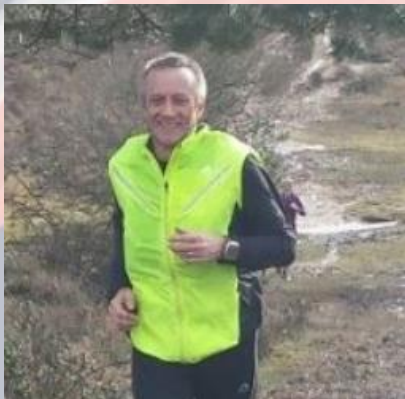
Graham Without Portfolio