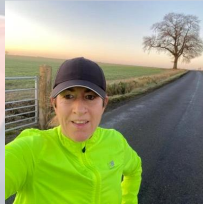
Anita Social & Welfare